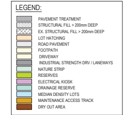
ROAD LAYOUT TABLE